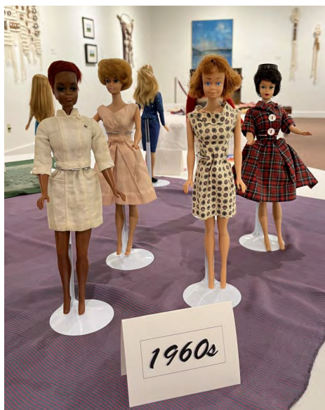
The Barbie-themed fun continues with a mini-exhibit on display in our Center store. Visit soon to see the Barbie and Ken dolls that span 60 years.

Our speakers series, Things That Matter attracted 35 guests for its