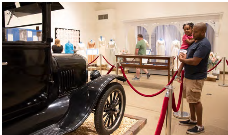
During the 2022 Heritage Festival a family checks out the Model T, the showpiece of the I Do exhibit on display in the West Walters History Gallery.