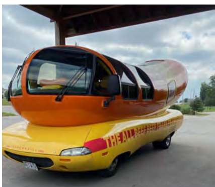
Oscar Mayer's Wienermobile stopped by the Center in early September.